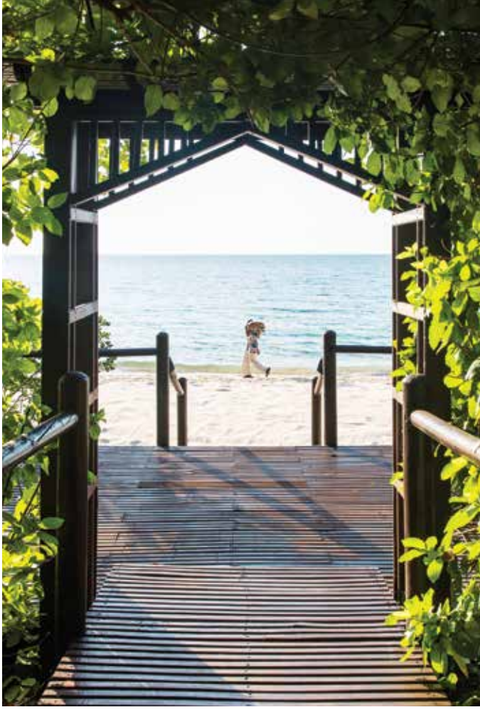
New resorts have helped fund schools, medical clinics and, on Benguerra Island (left), a dhow so the people can take their goods to the mainland for bartering.

I check in at Anantara, the archipelago's biggest resort, with 44 villas tucked into the tangled